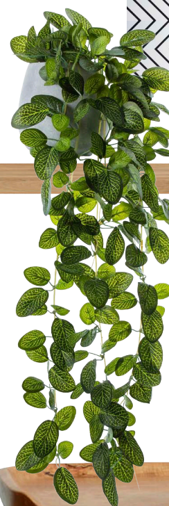
Home Republic 'St Ives' hanging pot with foliage, from $34.99, Adairs.