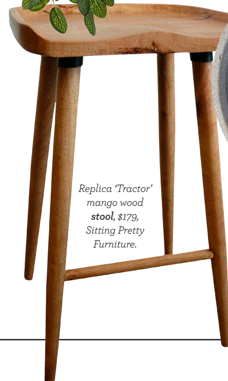
Replica 'Tractor' mango wood stool, $179, Sitting Pretty Furniture.