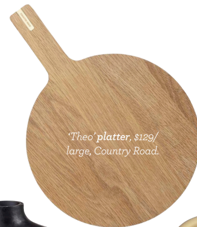
'Theo' platter, $129/large, Country Road.