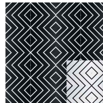
'SS303' cement tiles in Black and White, $153/sqm, Surface Society.

THE KEY TO RECREATING THIS COVETABLE KITCHEN? A FABULOUS FUSION OF NATURAL FINISHES COMPILED BY KYLIE JACKES