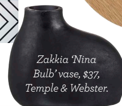
Zakkia 'Nina Bulb' vase, $37, Temple & Webster.