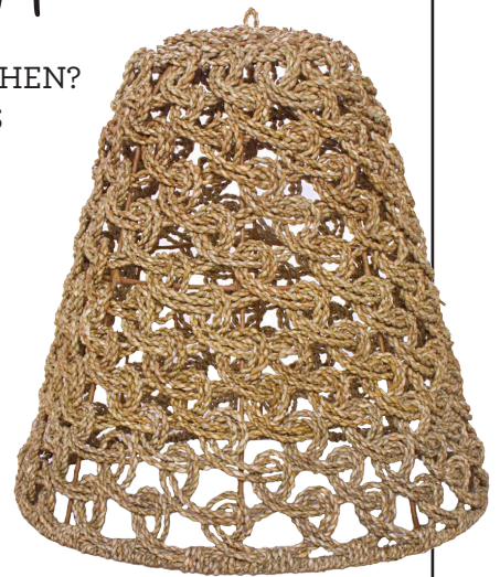
'Cocoon' hanging light in Swirl Natural, $100/large, Kim Soo.