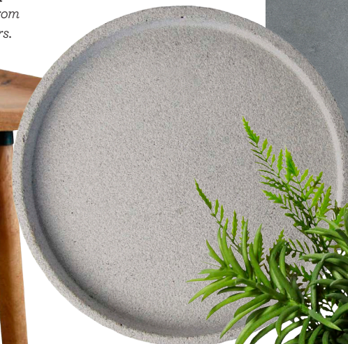
Zakkia 'Jason' concrete tray, $98/large, Temple & Webster.