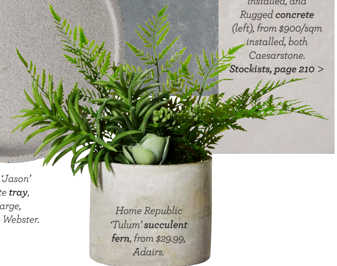
Home Republic 'Tulum' succulent fern, from $29.99, Adairs.